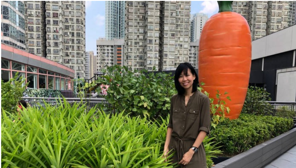
Rooftop Republic / Hong Kong