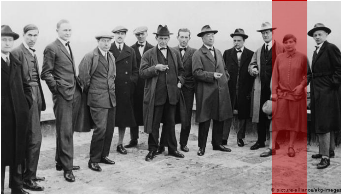
Bauhaus Founders, Weimar, Germany - 1919