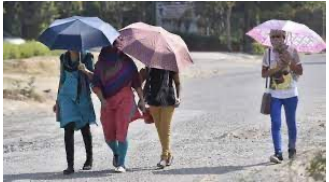
Walking the streets of Delhi, India, 2018