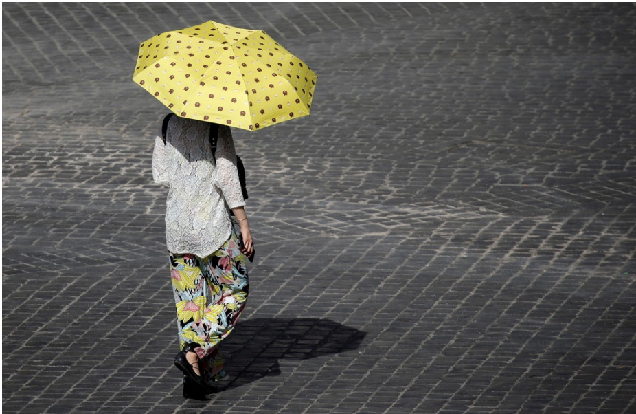
Walking the streets of Rome, Italy, 2018