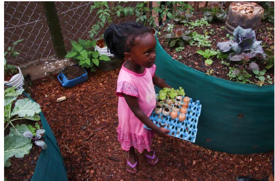
Kwagala Farm and Rooftop gardening/ Kampala