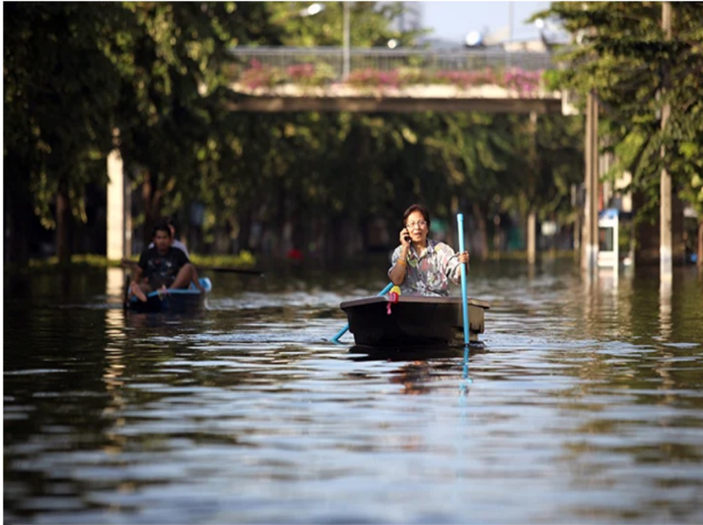
Bangkok flood 2011